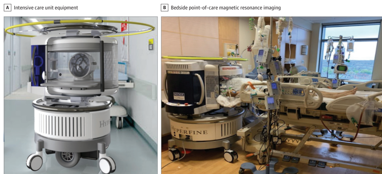
Figure 1. Point-of-Care Magnetic Resonance Images (0.064 T) in an Intensive Care Unit Room

All intensive care unit equipment, including ventilators, pumps, and monitoring devices, as well as the point-of-care magnetic resonance image operator and bedside nurse, remained in the room. All equipment was operational during scanning.